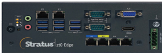
Figure 3. Some modern Edge Computing platforms are industrial grade, such as the ruggedized, Class I Division 2 (CID2) certified Stratus ztC Edge Computing platform, which can be installed in hazardous locations, with the PLCs, in the same control panel without special accommodations for temperature, humidity or vibration protection.

Scalability, extensibility, and standardization also are associated with advanced edge platforms, such as the smaller-capacity Stratus ztC Edge and large-capacity Stratus ftServer® platforms (see Figure 4).