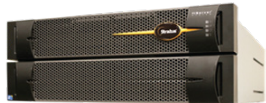
Figure 4. Advanced edge platforms, such as the Stratus ftServer platform, provide scalability, extensibility and standardization. The best Edge Computing platforms scale well as new nodes and locations are added.

The best Edge Computing platforms scale well as new nodes and locations are added. They are extendable to accommodate new operations and control capabilities without a significant investment, and flexible to extend monitoring and control of the plant to mobile devices. They also support standardization of all control into a single architecture and can meet non-redundant, high availability, or fault-tolerant needs. And the best edge platform can be easily installed, operated, and maintained by non-IT personnel.